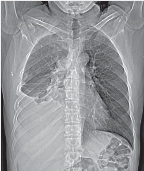
Figure 1. Digital chest radiography.

Male, 41-year-old, ventilation-dependent patient coming from Goiânia, GO, complaining of pain in the right hemithorax for 40 days. Additionally, the patient reported dyspnea at moderate stress and occasional dry cough. At clinical examination, decreased chest expansion and abolished vesicular murmur at the right lung base were observed. The patient was referred to the Unit of Radiology and Imaging Diagnosis to undergo chest radiography and computed tomography (CT).