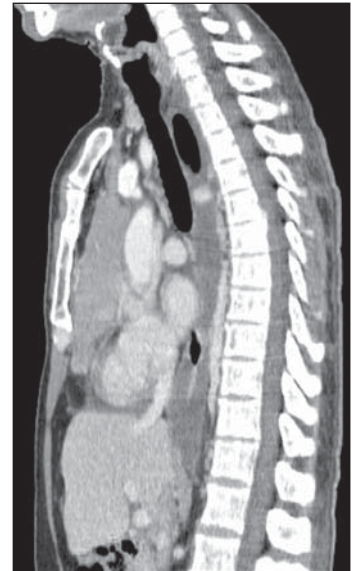
Figure 3. Chest CT, mediastinal window, contrast-enhanced sagittal section.