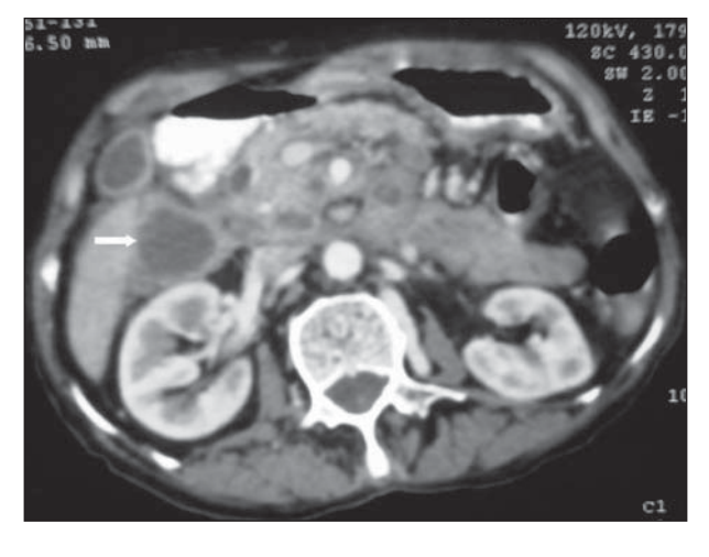
Figure 3. Infiltrating lesion involving the pancreas, duodenum and mesentery, with cystic areas (arrow) and extrinsic compression effect on the duodenum. The mentioned lesion presents a higher density than that described in the previous study.

The patient was given antibiotics for 48 hours and symptomatic medication for five additional days, with progressive improvement. She was discharged at the day 32 (5th